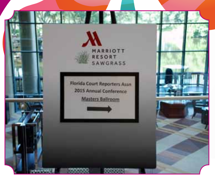
August/September/October/November 2015 • FCR Online